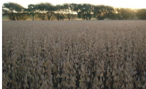
Fig. 1 Soybean field before harvest in the Argentinean Pampa, April 2013, authors' source